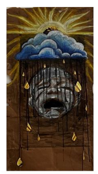
The drawing above was created by a McIntosh teen at a Mental Health Family Workshop.

In April, 2023, a community needs assessment and collaborative planning meeting to discuss school-based mental health needs was held in McIntosh County, GA.